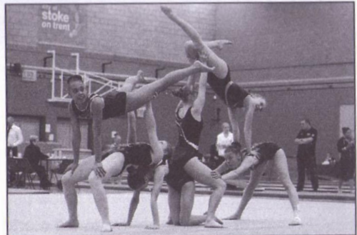
2 Bases, similar shape, 2 Tops, 1 on ground